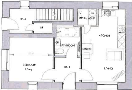
GROUND FLOORPLAN GF 40sqm FF 50sqm